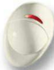
Neosphere K8 PIR Occupancy Sensor Models shown

Granville Square is a 33-year-old Vancouver landmark consisting of 29 floors of A class prime office space with spectacular views of the North Shore mountains and Burrard Inlet. The building is almost fully leased and over the years, many upgrades to the building mechanical and electrical systems have taken place, making the building reasonably energy efficient.